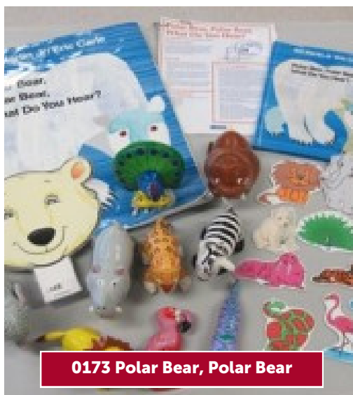
0173 Polar Bear, Polar Bear