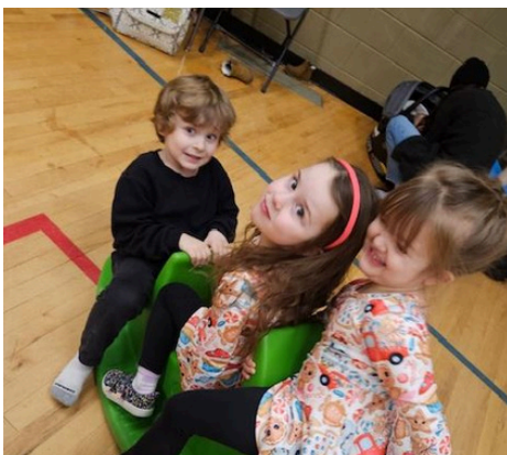
Active Play @ Highland Dvp. Centre

Did you get photographed at one of our events? Check out our social media to see if you were featured!