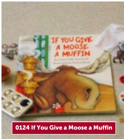
0124 If You Give a Moose a Muffin