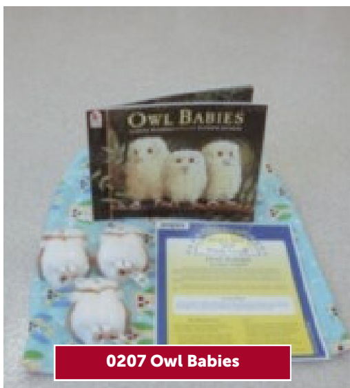
0207 Owl Babies