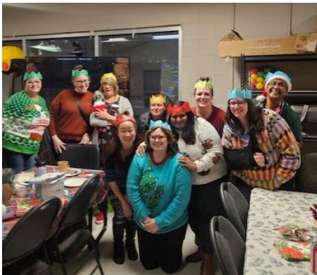
Tea's the Season Networking