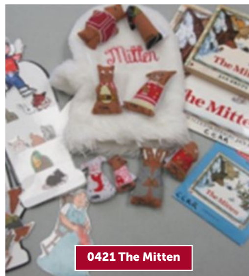
0421 The Mitten