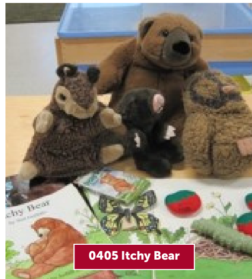
0405 Itchy Bear