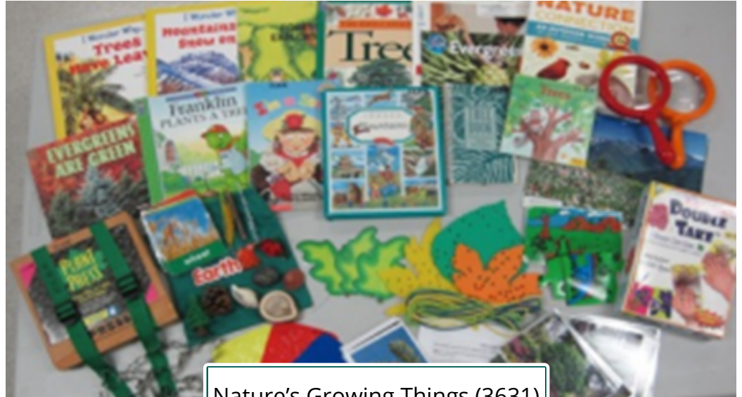
Nature's Growing Things (3631)

Finally, Spring is arriving in Prince George! The sun is shining, the birds are singing, and everything is starting to grow! Come join us at CCRR on Saturday, April 20, 10:00am-12:00pm for our Mud Kitchen. It will be a fun and messy time!