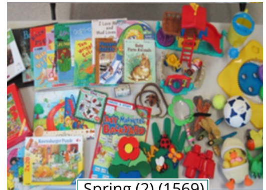
Spring (2) (1569)